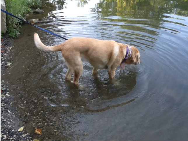
Straight into the water this time