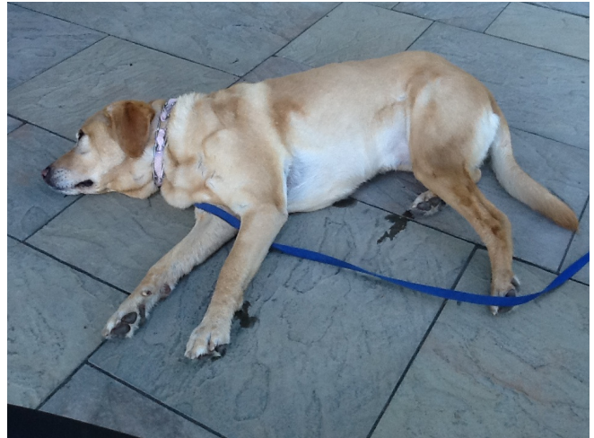
Relaxing and drying after a visit to the river