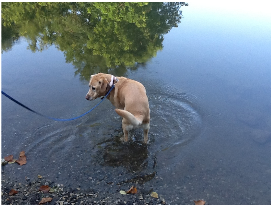
Her first trip into the river

At the end of the day she was exhausted from walking, socializing and going to the river.