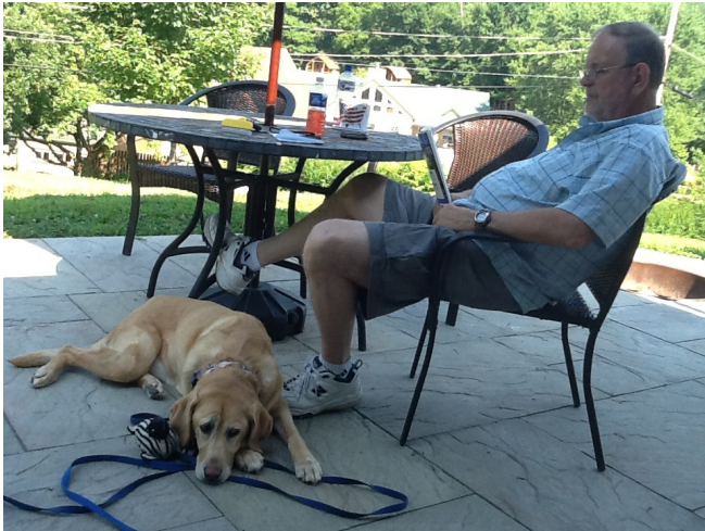
Abbey and Daddy relaxing